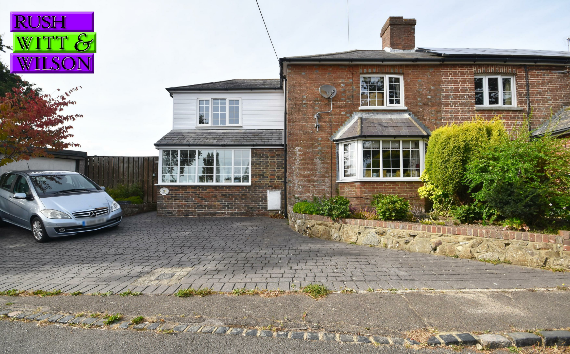
Faith Cottage Elms Lane, Hastings, East Sussex TN35 4JD Guide Price £525,000 Freehold